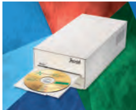
Inscripta Thermal CD/DVD Printer

ComposerMAX is from Primera Technology, the world's leading developer and manufacturer of CD/DVD duplicating and printing equipment. Its management is responsible for the design and manufacture of well over one-million thermal transfer, dot matrix and inkjet printers, including the popular Signature-series CD/DVD printers. Primera Technology products are sold in over 85 countries.