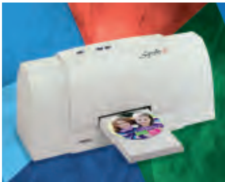
Signature Z6 CD/DVD Printer